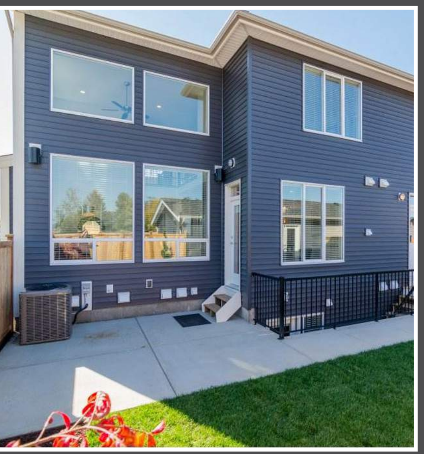
Not intended to solicit properties currently listed for sale or individuals currently under contract with a Brokerage.