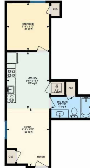
Suite Exterior Area 517.81 sq ft