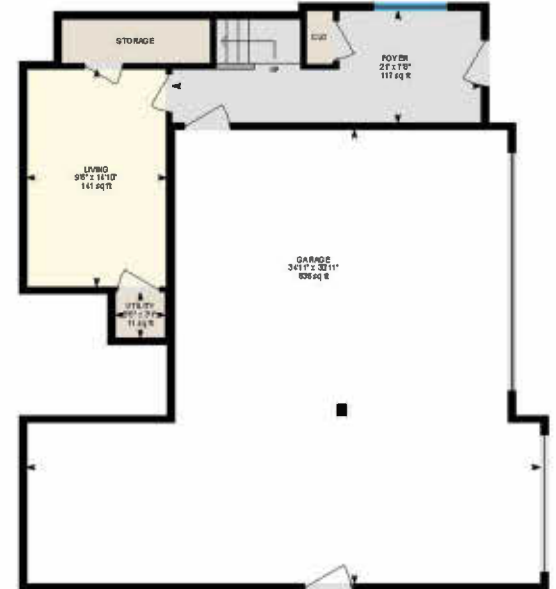
Lower Level Exterior Area 389.25 sq ft