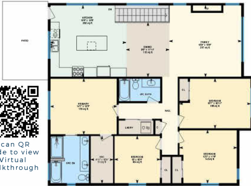
Upper Level Exterior Area 1725.21 sq ft

Scan QR Code to view Virtual Walkthrough